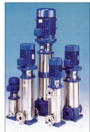
Pumps complete with pressure switch, check valves & orifice ball valve